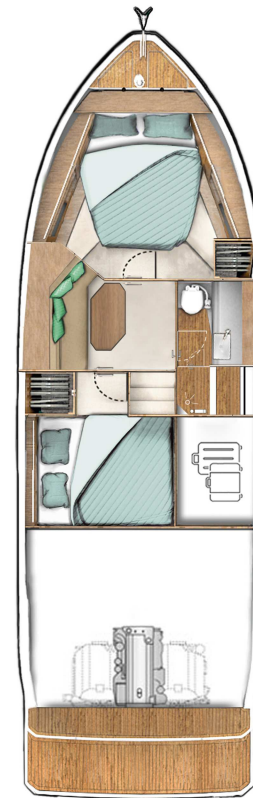
LOWER DECK option