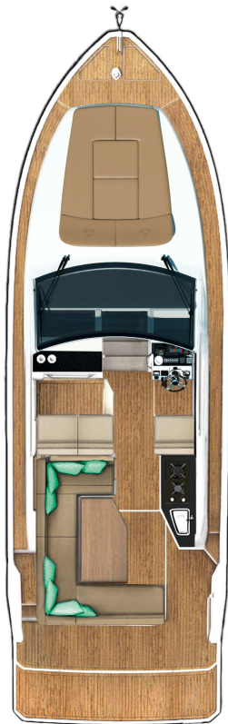
MAIN DECK with extended bathing platform