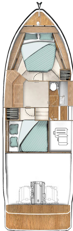
LOWER DECK standard