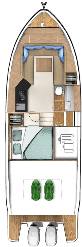
LOWER DECK option