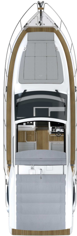
MAIN DECK Option with soft-top