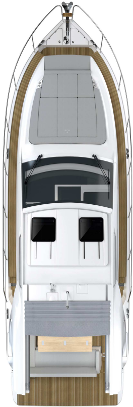
MAIN DECK Standard