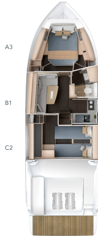
LOWER DECK Option galley with electric cooking top and microwave