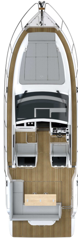
MAIN DECK Option with barbecue at stern, long platform and fixed cockpit table