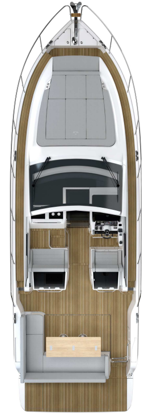
MAIN DECK Option with cockpit table to be transformed into sunpad and extended bathing platform