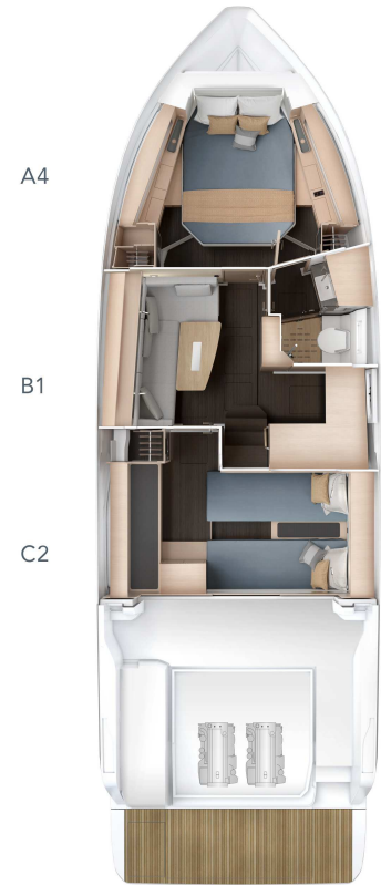
LOWER DECK Option storage room with cupboards